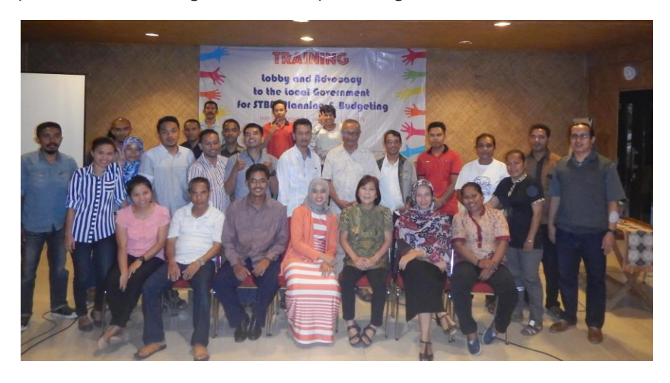
Figure 6. Participants of ToT on lobby and advocacy

As indicated in the proposal, some activities are to be implemented with partners. However, due to late of programme start, a few activities were shifted to the next period. These activities are: