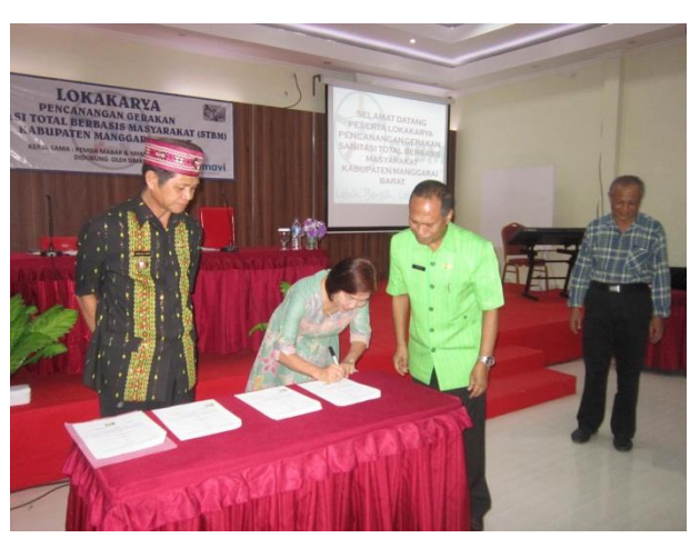
Figure 1. YDD and district government signed the MoU

Yayasan Dian Desa is working in District Manggarai Barat with 3 sub-districts in 2016, namely Kec. Komodo, Kec. Welak, Kec. Boleng. 15 villages are intervened within this year out of 75 targeted for the whole project period. This district is a new administrative district; previously, it was sub-district of District of Manggarai. Its area consists of land in West Flores and other islands, such us Komodo Island, Rinca Island, Seyara Besar Island, Seraya Kecil Island, Bidadari Island and Longos Island. The area of Manggarai Barat is 9.450 km², consists of 2.947,50 km² of land area, and 7.052,97 km² of sea area. It consists of 10 sub-districts and 164 villages and 5 urban communities ( kelurahan ).