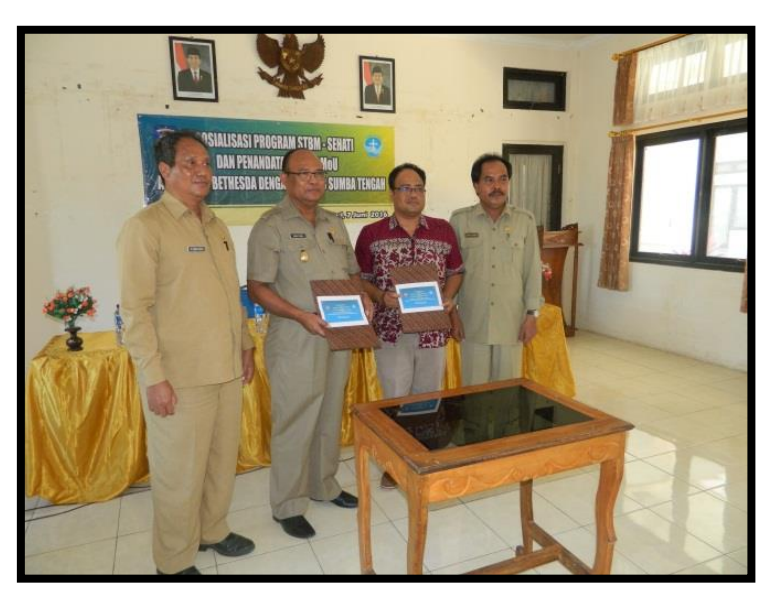
Figure 5 The signature MoU between CDB and district government in Sumba Tengah

CDB finished their baseline capacity data collection in this period for both districts. The data shows that the government capacity to implement STBM does not fully meet the SEHATI indicators. These figures are contributed by availability of the regulation, budget and work plan in Sumba Barat Daya, although but they are still lacked of capacity to implement STBM. In Sumba Tengah, regulations are not clear enough to implement STBM and lack of budget remains the biggest problem. However, they have adequate human resources and work plan to implement STBM at the Dinkes.