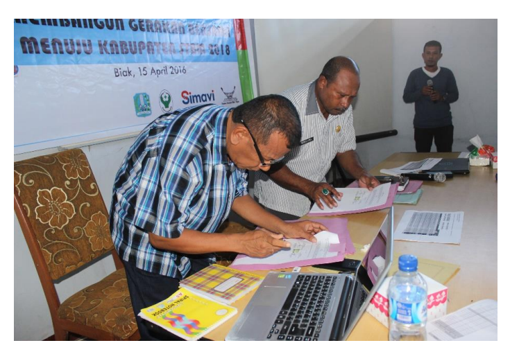
Figure 4 The signature of MoU between Rusmram and district government

Yayasan Rumsram is working in District Biak Numfor with 10 sub-districts (6 new sub-districts and old districts/SHAW location). Total villages are 35 villages. In 2016, they work only in 8 sub-districts (4 old and 4 new). 24 villages of 4 sub-districts have not been declared STBM yet. Rumsram will support the government to ensure those old sub-district will be declared 100% STBM in 2016. To reach 100% STBM District in 2018, Dinkes and Puskesmas will conduct replication in other areas in 2017.