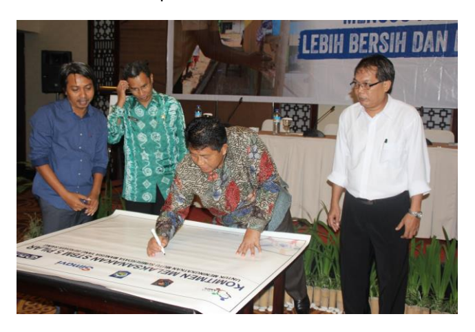
Figure 3 The signature of MoU between Plan and provincial government

Baseline capacity data for districts level has been collected during this period. In Lombok Utara, the data shows that the government capacity to implement STBM do not fully meet the SEHATI indicators. The same case occurs in Dompu district.